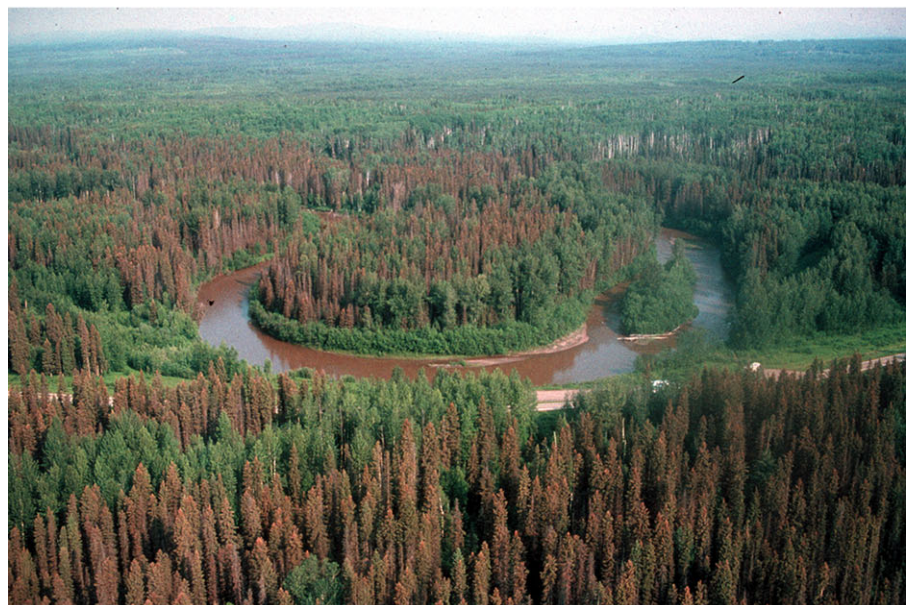
Figure 2 Top: Forest fire in Alaska. Bottom: Spruce budworm (Choristoneura fumiferana) attack on white spruce forest (Picea glauca) of northern British Columbia.

Abbott 2011), likely leading both to areas of increasing wetness that become methane sources (Zhuang et al. 2007) and to dry areas that are more prone to wildfire and insect outbreaks (Kasischke et al. 2010). There has also been an increased harvest of boreal forests to provide timber products (Potapov et al. 2011), as well as supporting an expanded use of forest biomass as a substitute to mitigate the impact of burning more energy-intensive fossils fuels (Poudel et al. 2012).